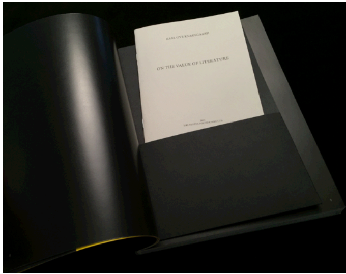
Karl Ove Knausgaard, On the Value of Literature (removable pamphlet from Esopus 23 )