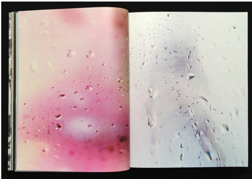
Spread from Spray On , 2016, an artist's project by Marilyn Minter from Esopus 23