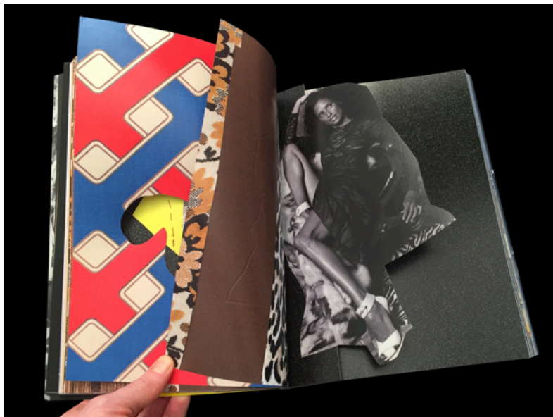
Spread from Together , 2016, an artist's project by Mickalene Thomas from Esopus 23

All images © the contributors and Esopus Foundation Ltd.